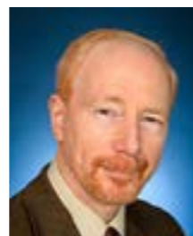
Robert A Neimeyer

On the one hand, grief following the death of a significant attachment figure is a normal human response, that should not be considered a psychiatric disorder. However, an enormous body of research in many countries has led the World Health Organization (2019) to recognize Prolonged Grief Disorder in its most recent edition of the International Classification of Disease (the ICD-11) as a stress-related condition distinguishable not only from adaptive grieving, but also from depression, anxiety, and posttraumatic stress disorders (see Table 1). In this form of life-vitiating, protracted and anguishing response to loss, mourners struggle with turbulent emotions of longing, guilt, loneliness and desolation which tangibly impair their ability to function in the contexts of family, work and the